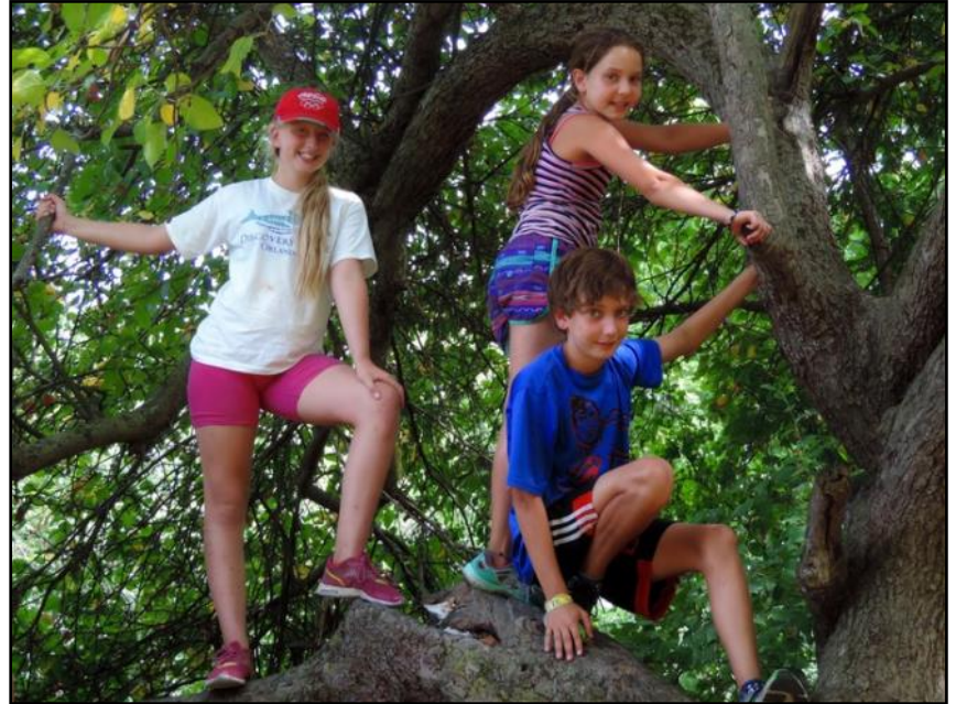
Some of our very happy campers

Swim, hop, or leap to compete to be Presqu'ile's top athlete. On your journey to the podium learn how animals struggle against each other for the resources they need to survive.