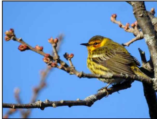
Cape May Warbler, Presqu'ile

It's hard not to get excited as the days grow longer and warmer. Particularly this year after a very strange winter that had the ice off Presqu'ile Bay by the end of February and then frozen solid again in mid-March. Enough already! But the days are getting longer and spring comes with all sorts of promises, not the least of which is the prospect of returning birds.