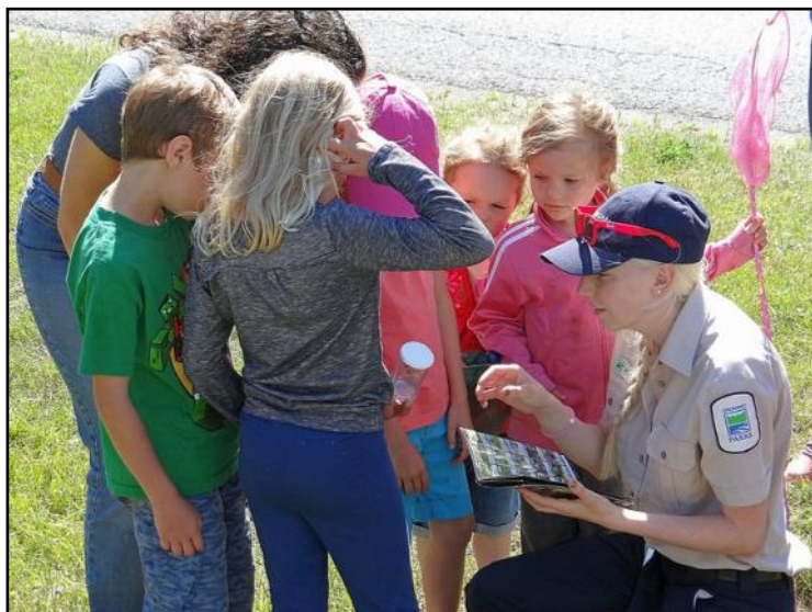
NHE staff, supported by The Friends, deliver numerous summer educational programs

The Friends of Presqu'ile's mandate is to support educational and environmental initiatives in the Park. It is the former that I am most appreciative of, as it is the education department that I run at the Park. Our department is called Natural Heritage Education (NHE) and our goal is to help people connect with our natural world as well as our cultural heritage. Traditionally we do that through personal programming (mostly in the summer), interpretive signs throughout the Park, displays in our two visitor centres, and articles in our information guide (tabloid) and other print media. There is not one aspect of this suite of tools we use that The Friends are not there assisting us with.