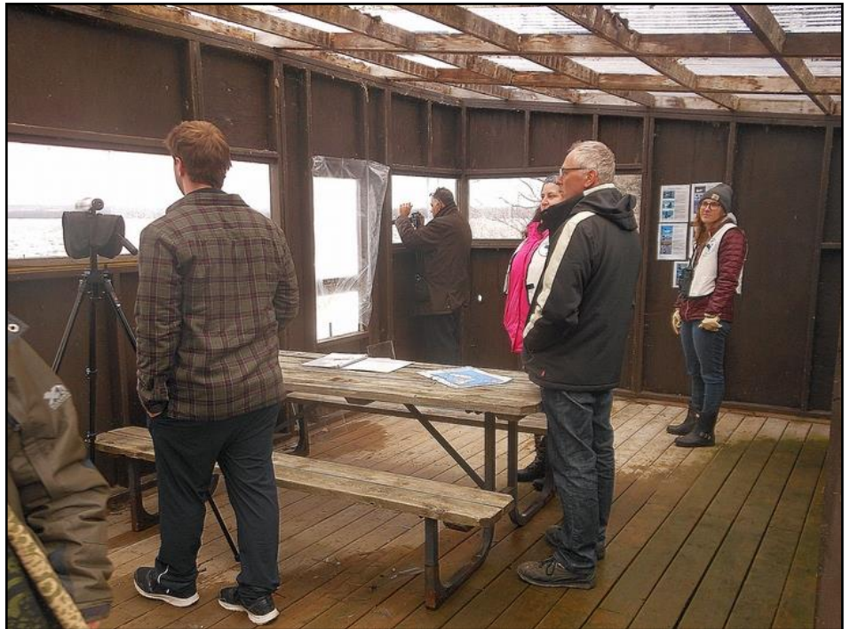
Volunteers and visitors enjoying the hide at Calf Pasture

Really the only thing missing were people, things seemed very quiet, though even that was a bit