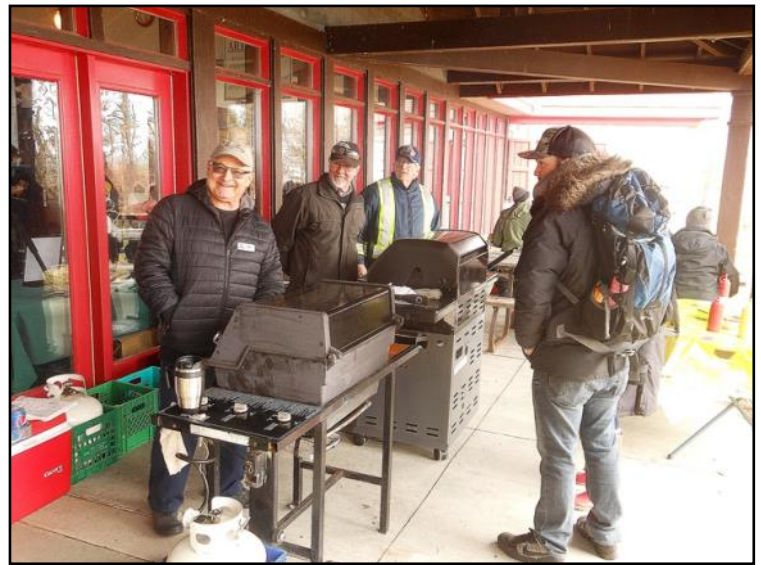
The Friends' BBQ at the Lighthouse